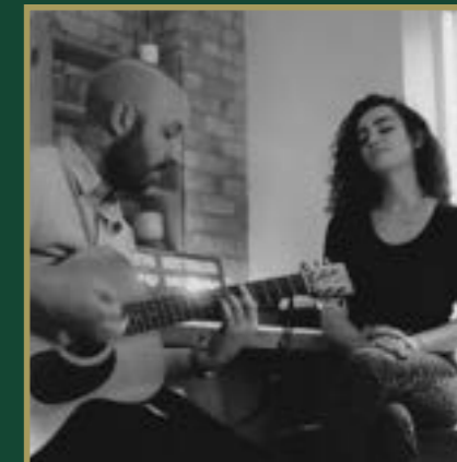
GIN & FIZZ