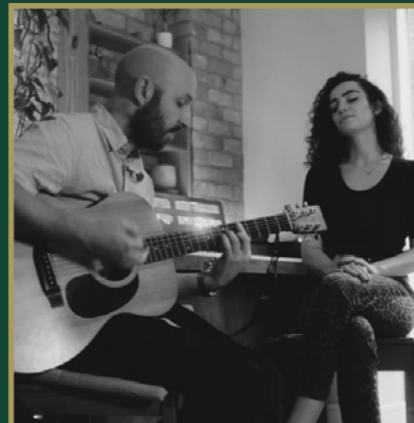
GIN & FIZZ 3 MAY 9.30PM - Midnight