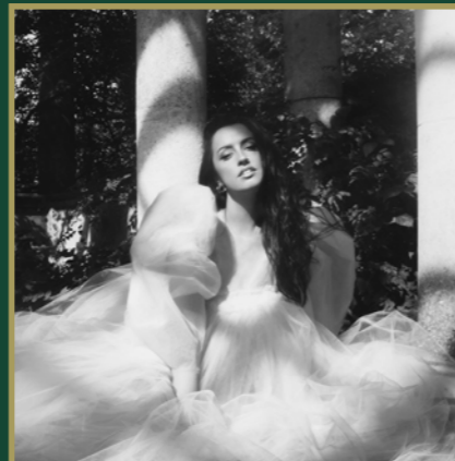
RUBY IVY 2 MAY 9.30PM - Midnight